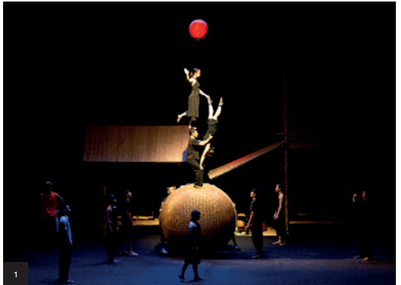
1. Ferme du Buisson, Vietnam New Circus

Artistic responsibility is expressed, with regard to the general public, through a multidiscipline programme whose construction must reflect, in a balanced manner, the stand contemporary productions and the more avant-garde artistic approaches. Public responsibility is translated by the permanent consideration paid to an area and its community, in all their specific features. This involves programme choices, actions conducted in connection with other performing arts organisations, accredited or not, professional guidance towards creativity. The professional responsibility involves the availability of each centre with regard to its local area, advising, guiding, encouraging the sharing of work, proposing training and the achievement of excellence concerning the positions concerning support for creativity and staging, coordinating artistic partnerships with other organisations.