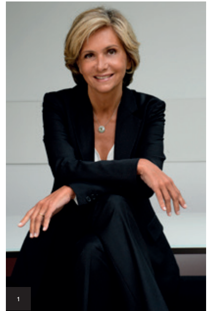
1. © Paris Region

President of the Regional Council for the Paris Region