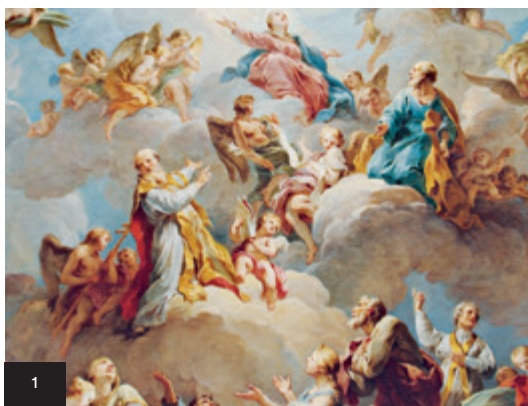
1. François Lemoine, La Vierge en gloire ( Chapelle de la Vierge ) 1732 Église Saint-Sulpice

Outside of the exhibition period, churches in Paris were known as places to admire painting from the 18th century. This exhibition aims to reveal the significance and the diversity of religious painting in Paris, from the Regency to the Revolution: from the heirs of the grand siècle, such as Largillière and Restout; to disciples of rocaille, from Lemoine to Carle Van Loo; to the best of Neoclassicism, from Vien to David. In addition to immense altar paintings, the Petit Palais's galleries also feature sketches and other large paintings that were scattered among different museums, churches, and cathedrals throughout the country, offering visitors the opportunity to rediscover an entire segment of 18th-century painting at its peak.