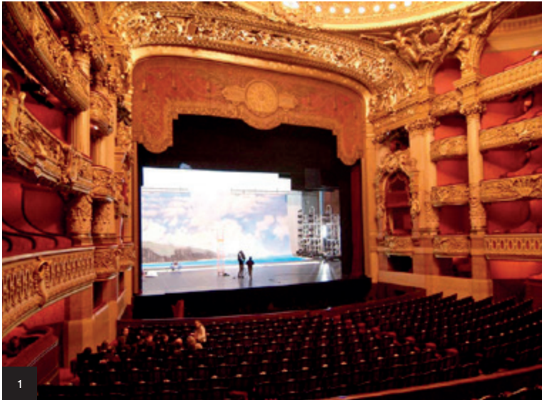
1. Paris Opera

The policy conducted by the French state in favour of permanent orchestras, particularly in the different regions of the country, aims at enabling the existence and the development, across the whole country, of high-level professional symphony orchestras. Their main mission is to enable as many people as possible to have access to musical works both repertory and contemporary.