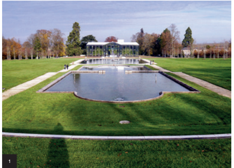
1. Paris Region FRAC, chateau de Rentilly

The Paris Region FRAC displays its collection and exhibitions in two locations in Paris and also in the Chateau de Rentilly as well as in over ten art centres spread across the region.