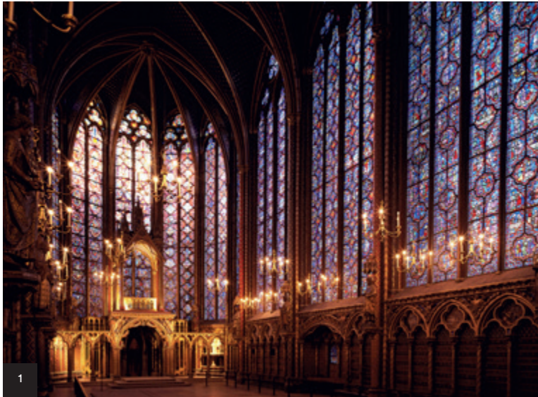
1. © Sainte-Chapelle

Paris features a truly outstanding heritage, unique in the world, and is recognised by UNESCO through the city's inclusion on its World Heritage list. "By tracing the path that takes in the Louvre, the Eiffel Tower, the place de la Concorde , the Grand Palais and the Petit Palais, the changing face of Paris and its historical evolution are clearly viewable from the Seine river. Notre-Dame Cathedral and Sainte-Chapelle are architectural masterpieces. As for the wide squares and avenues built by Haussmann, they have influenced urbanism from the end of the 19th century and the 20th century throughout the world" (UNESCO).