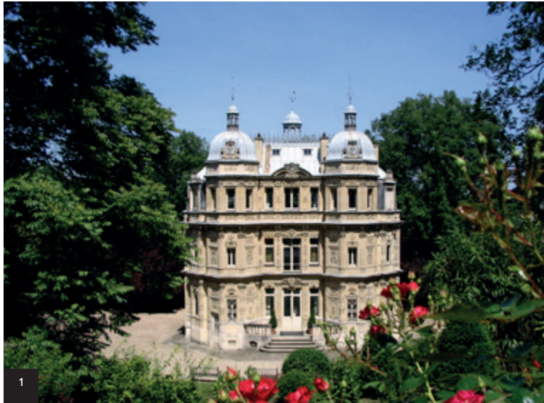
1. Le Chateau de Monte-Cristo, JPB