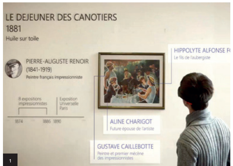
1. © Holostoria by Opuscope

In order to favour these innovations, a Call for Expression of Interest worth €100m was launched by the Government in December 2016 for projects aiming to showcase culture and heritage, as part of the Investing in the Future Programme (PIA).