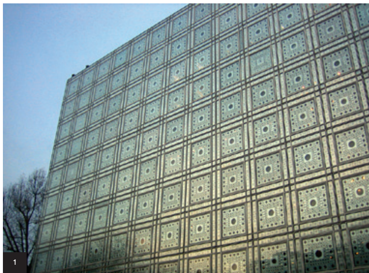
1. © Matita

3,148 buildings or urban complexes have obtained this label. Examples include the Covered Market (Belfort), Arab World Institute (Paris), l'imprimerie Mame (Tours), la Cité radieuse (Marseille), la Grande Arche de la Défense (Paris), the urban complex of the Les Arcs ski resorts, etc.