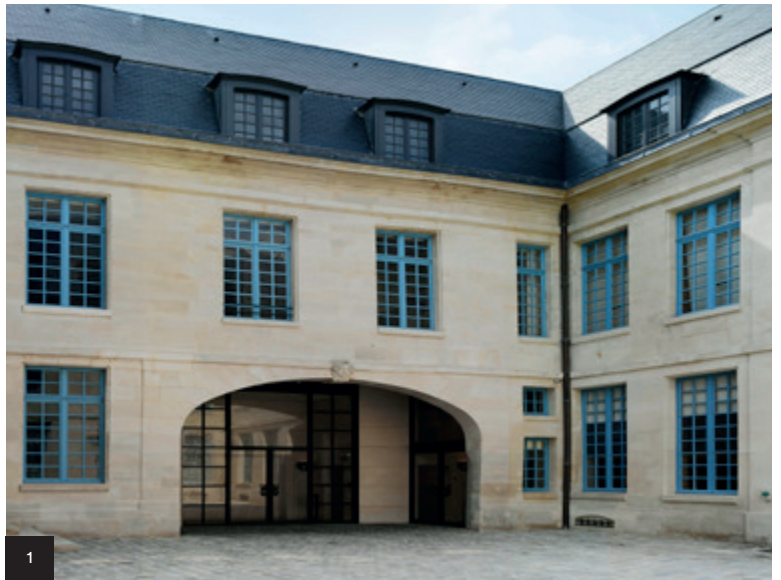
1. Hunting and Nature Museum, museum's courtyard, hôtel de Mongelas

National collections are contained in 40 national museums and two regional satellite museums.