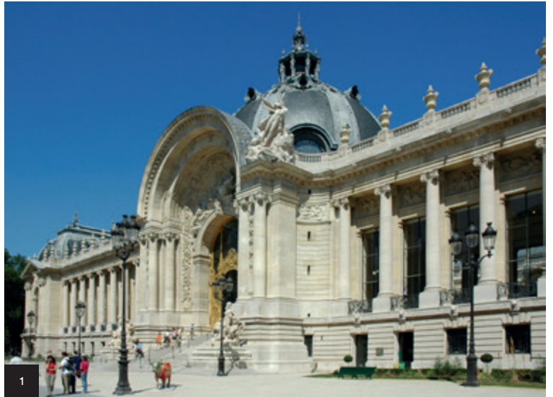
1. Petit Palais, 2006

A website, parismusees.paris.fr , enables people to access the full list of the museums' events, discover the collections and prepare for visiting.