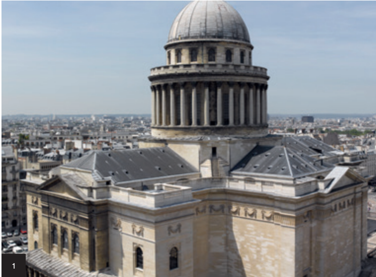
1. Le Panthéon

The Centre des Monuments Nationaux (CMN, National Monuments Centre) is responsible for managing around a hundred state-owned monuments all over France. Each building occupies a major place in the national heritage, and all hold an important place in the history of France, the history of architecture and the history of art.