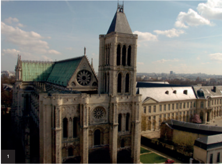
1. Saint-Denis Basilica, Saint-Denis

Created in 1985, the "Ville ou Pays d'art et d'histoire" (towns and areas of art and history) label is attributed by the Minister of Culture and Communication, following the approval of the Conseil national des Villes et Pays d'art et d'histoire (National Council of Towns and Areas of Art and History). It describes the areas, towns or groups of villages and towns that are committed to an active programme of knowledge, conservation, showcasing, interpretation and support concerning creativity, architectural quality and the living environment.