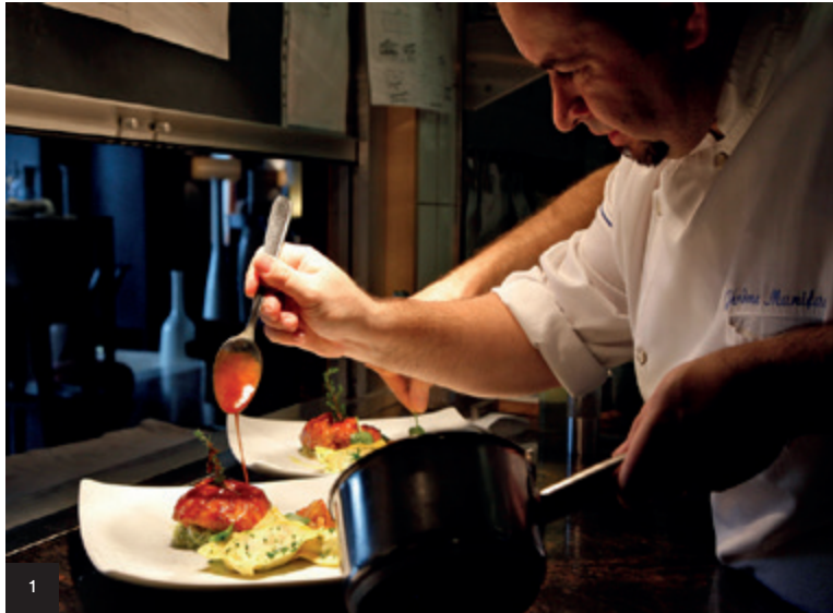
1. Hôtel de la Paix

The cultural appeal of France is also rooted in its intangible cultural heritage. The idea of “cultural visits” also encompasses visiting sites and discovering the city by strolling through its streets, shopping, visiting parks and gardens, French gastronomy, markets and bric-a-brac events.