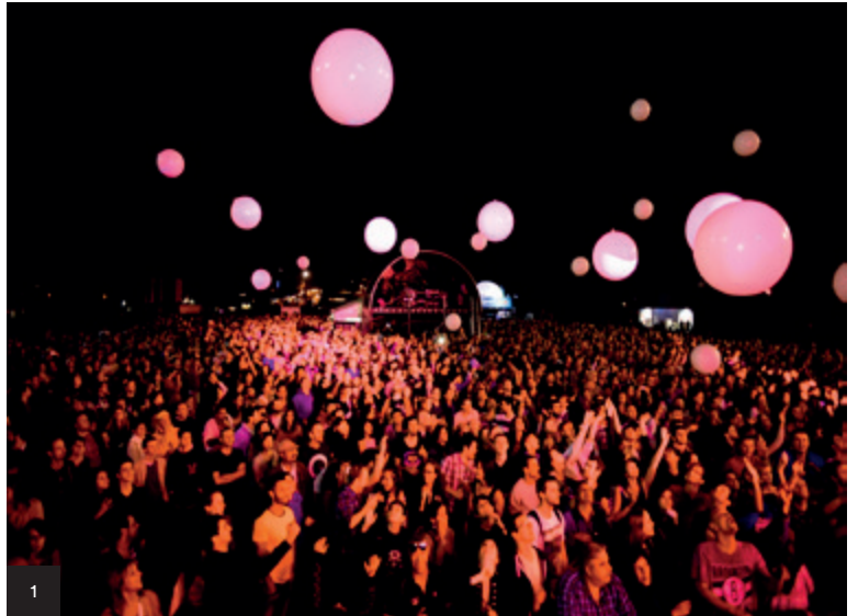
1. Fête de la musique 2014

Their diversity meets the expectations of children and adults alike. They can all be enjoyed alone, with the family or groups of friends.