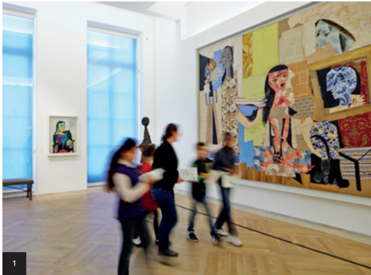
Musée national Picasso-Paris

The majority of the large French museums have programmes for children: special activities, guided visits and educational workshops. Children from the age of two can have fun discovering and trying different things in the Palais de la Découverte (Palace of Discovery) and the Cité des sciences et de l'industrie (Science and Industry City) which has a Cité des enfants (City for Children). In addition to the Galerie des enfants (Children's Gallery), the Centre Pompidou has created an area for teenagers, Studio 13/16, with free programmes for children aged between 13 and 16.