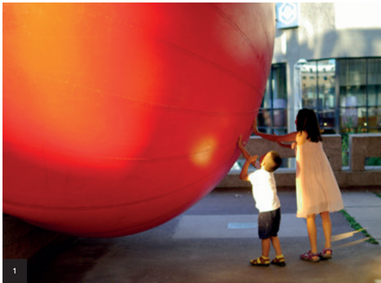
1. Kurt Perschke, RedBall Montréal, 1 st September 2014