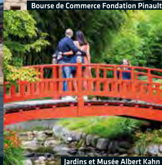
Jardins et Musée Albert Kahn