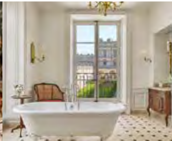
Hôtel Le Grand Contrôle