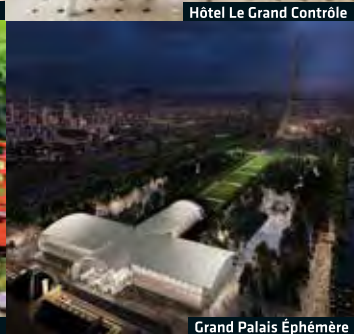
Grand Palais Éphémère