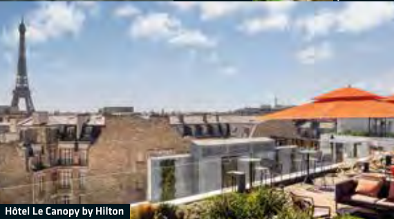
Hôtel Le Canopy by Hilton