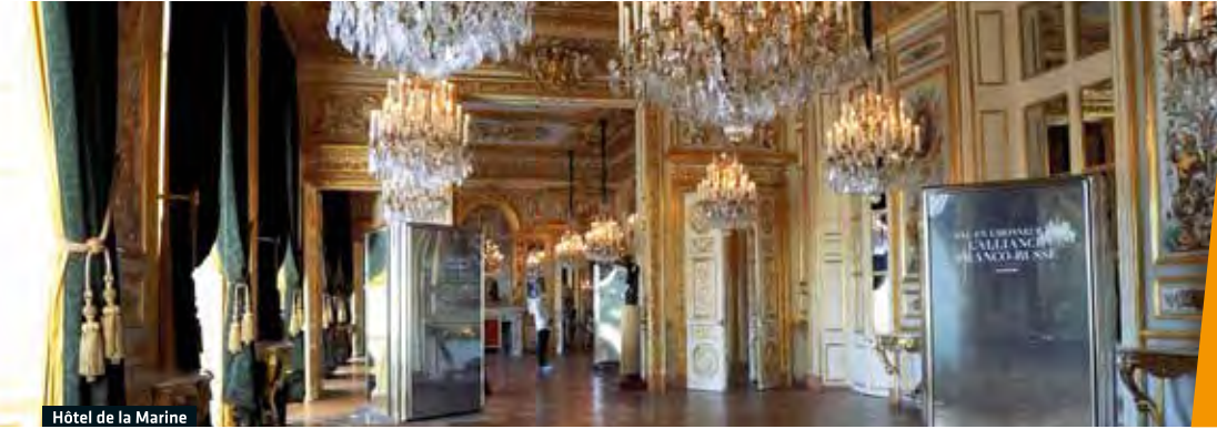
Hôtel de la Marine