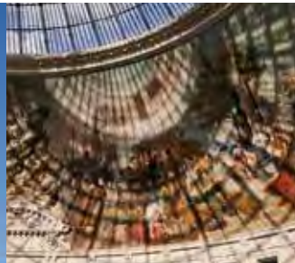
Bourse de Commerce Fondation Pinault